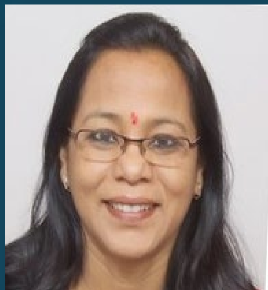
Dr. Reeta Rasaily

September 24, 2021; 5:00 - 8:00 pm (IST)