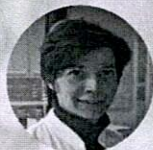
Elisa Giovannetti Cancer Center Amsterdam, Netherlands