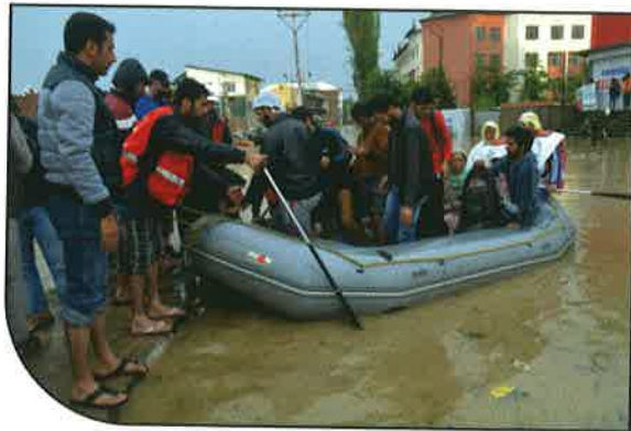
Rescue Operation during J & K Floods