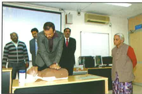
Lecture and demonstration being held on 10.2.2016