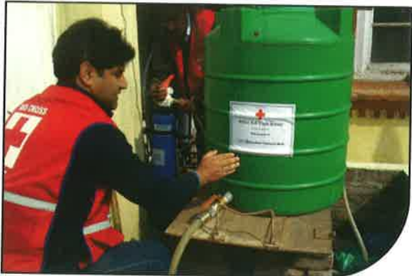
Installation of Water Purification Units at Kashmir during J & K Floods