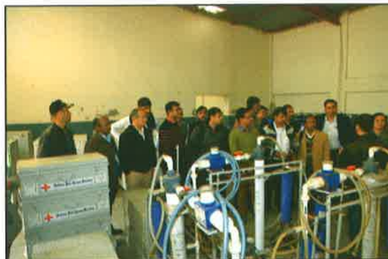
A field visit of students to the IRCS Regional Warehouse, Bahadurgarh on 30 th January, 2016

IRCS has airconditioned lecture hall in DMC and in NHQ main building with a capacity of about 60, equipped with multimedia, plasma screens, video conferencing, computer and printing facility and an auditorium in Bahadurgarh with the capacity of about 100.