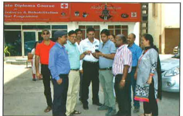
Students of the 10 th batch being imparted training on Geo Positioning Systems on GPS 9 th April 2016