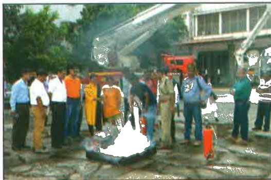
◀ Demonstration on managing disaster due fire underway at Delhi Fire Services, Connaught Place, New Delhi on 17 th October, 2015