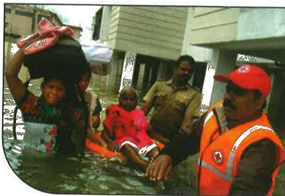
Rescue Operation during Chennai Floods