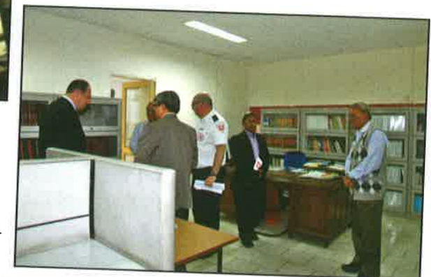
A view of library at Disaster Management Center, IRCS ▶