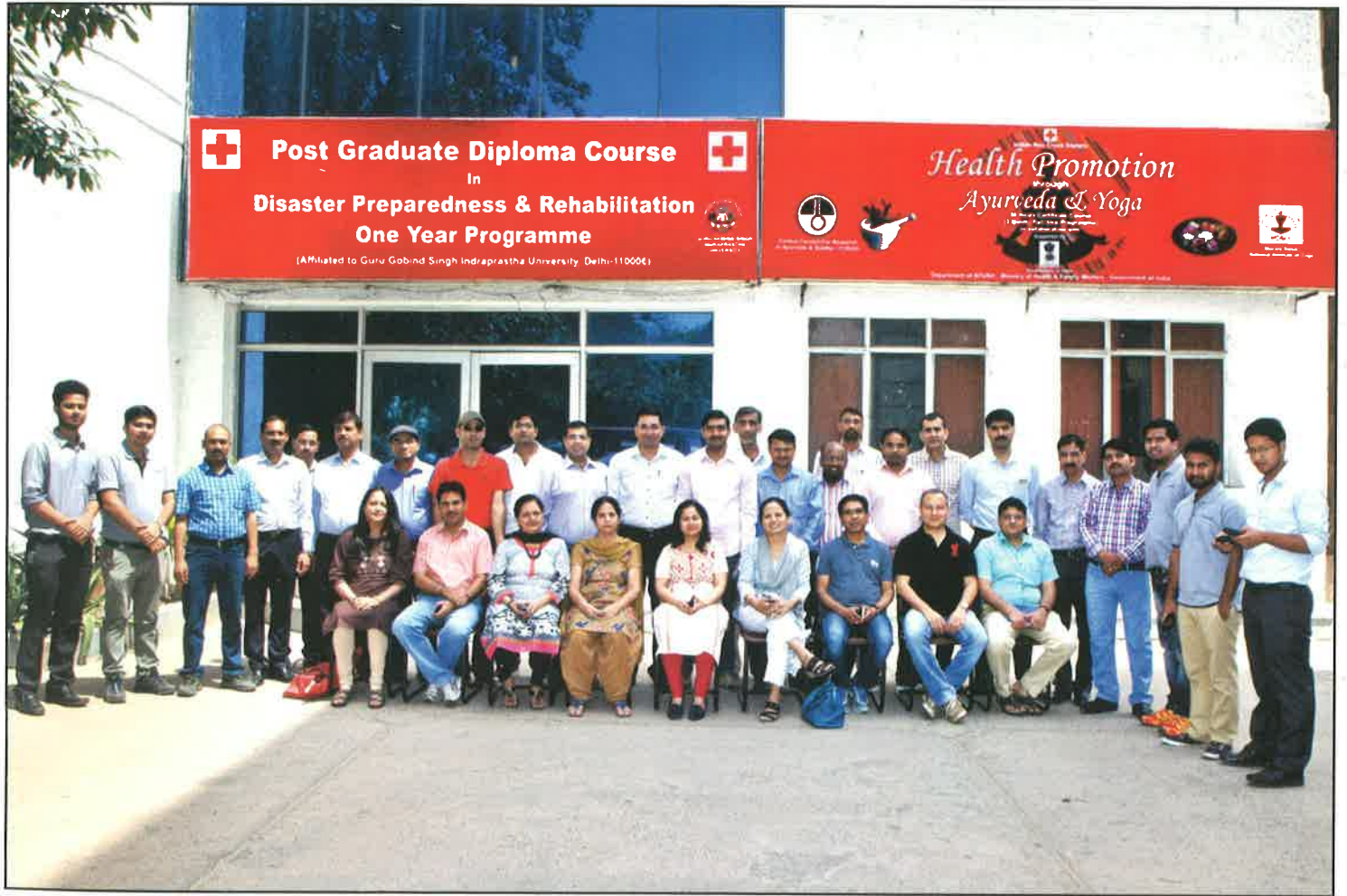
Tenth Batch (2015-16)