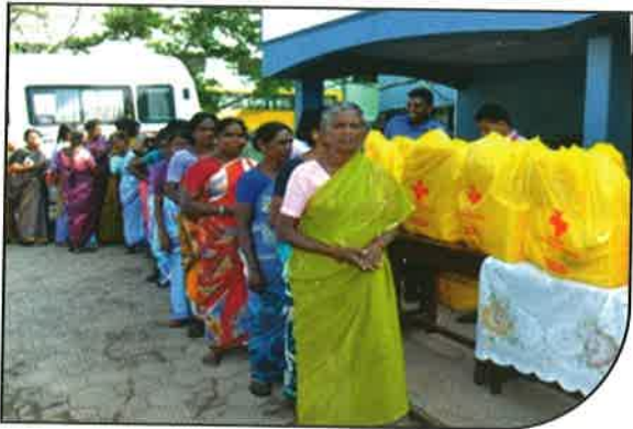
Relief distribution to affected community of Chennai Floods