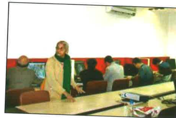
◀ Remote Sensing and GIS Practical in progress.

If a candidate withdraws after payment of fees, no refund can be claimed.