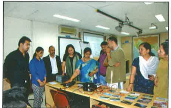
A HAM radio training session being taken at the lecture Theatre of the Disaster Management Center on 5.3.2016