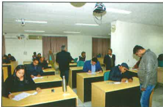
End term examinations of the students of 9 th batch of PG Diploma course in disaster preparedness and rehabilitation underway in December 2015