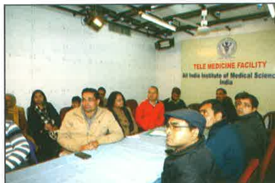
A visit of students to the Telemedicine centre at AIIMS, New Delhi on the 16 th January, 2016

IRCS has multiple halls with video conferencing facility (Adobe Connect Software).