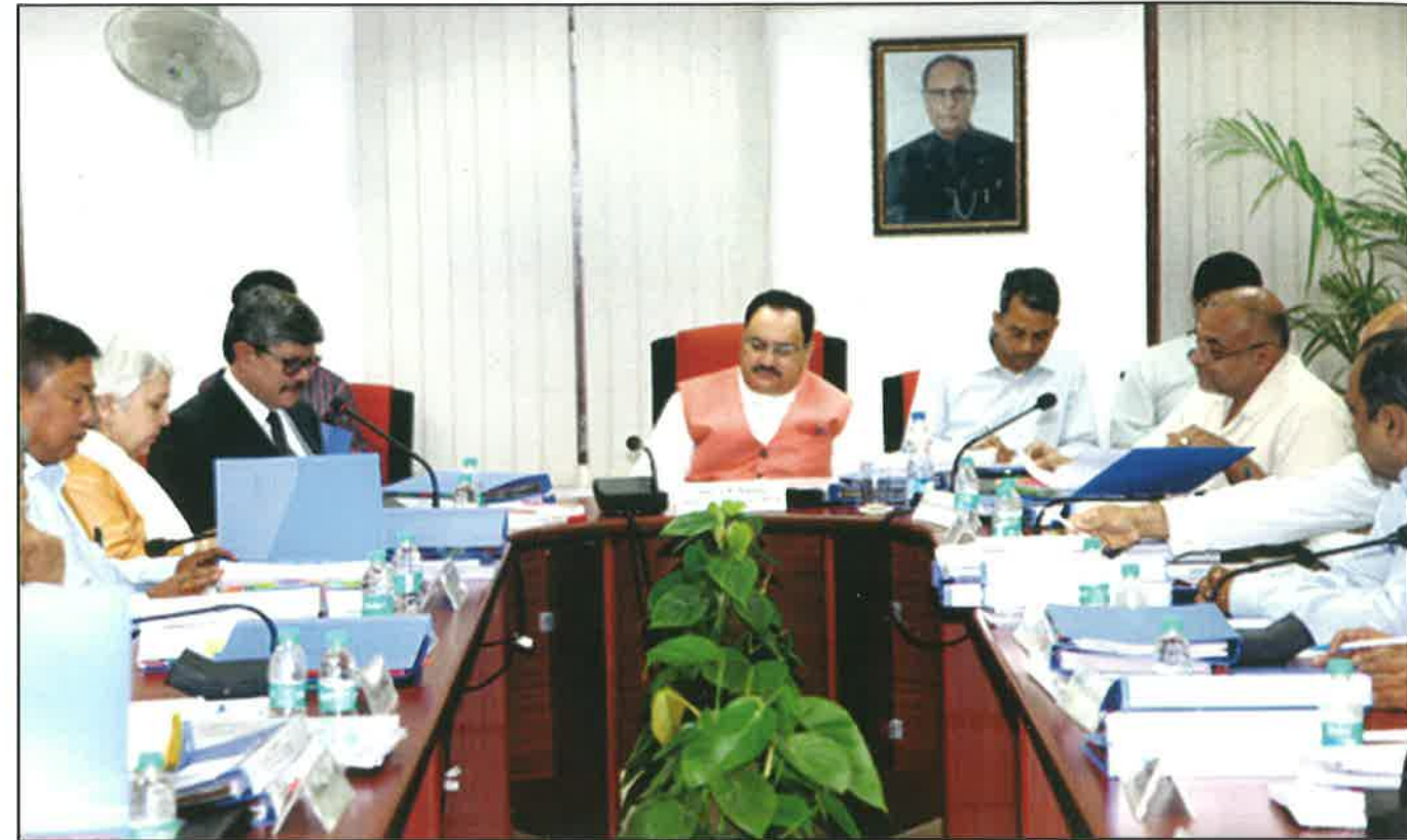
Shri J.P. Nadda, Chairman, Indian Red Cross Society and Hon'ble Minister of Health and Family Welfare (Govt. of India) chairing the Managing body meeting on 29.3.2016.