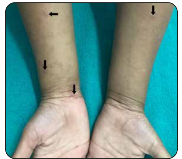
Excoriated papules at the typical sites – breasts, abdomen, web spaces of fingers and wrists