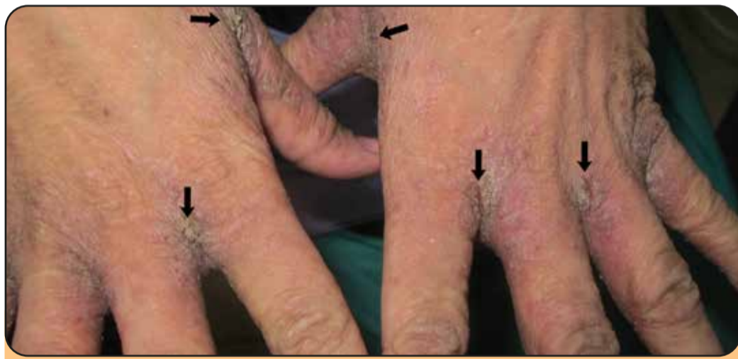
Crusting in finger webs in localised crusted scabies