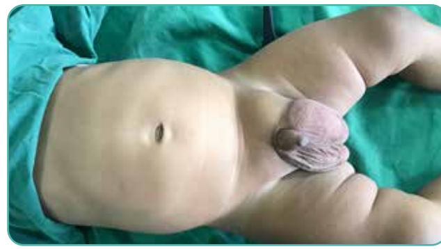
Obstructive inguinal hernia

CONSTITUTIONAL SYMPTOMS: When the hernia is incarcerated, and the bowel perforated